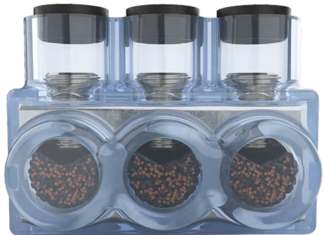
Conductor insertion and oxide inhibitor presence can be visually verified after installation.