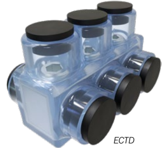
ClearTap® Single- and Dual-Sided Entry Insulated Multi-Tap Connectors