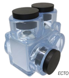
ClearTap® Two Wire In-line and Offset Insulated Splicer-Reducers